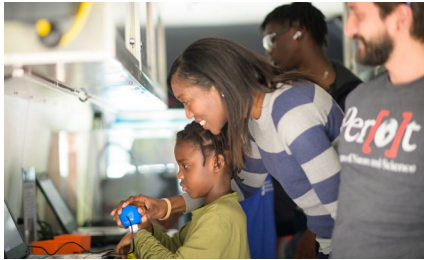
Families engage in S.T.E.A.M. activities at Kids Fest 2024.

"I really love all the education and tools [KERA] gives parents. I will definitely download the apps and allow my child to have access to media in a safer and educational way."