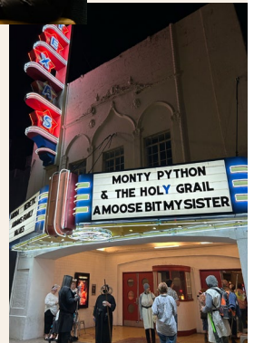
Right: KERA celebrated the 50th anniversary of debuting Monty Python's Holy Grail in the U.S.