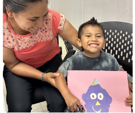
A family at a KERA Learning Workshop.

LAUNCHED A BILINGUAL CHILDREN'S PODCAST, TIEMPO TRANQUILO